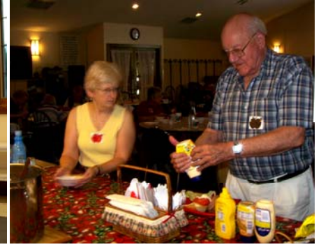
Senior Luncheons are back! See p. 4 for info. on this year's theme.