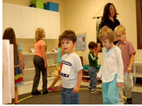
The children in Children's Worship Level I "walking the line" at the beginning of class. Sunday classes have gotten off to a great start!