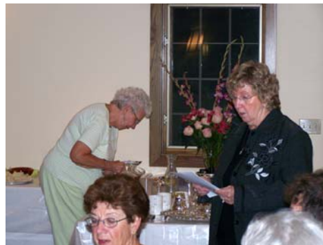
The ladies who attended the September ECW meeting had a good time with the "Southern Ladies Guide to Hosting a Perfect Funeral." October 14 is the next meeting!