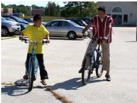
Bikes and boots and toys...oh my! Thank you for the ongoing donations to our Refugee Ministry. Stay tuned for requests as things are needed. See p. 3 for info. on the Refugee Dinner in November.